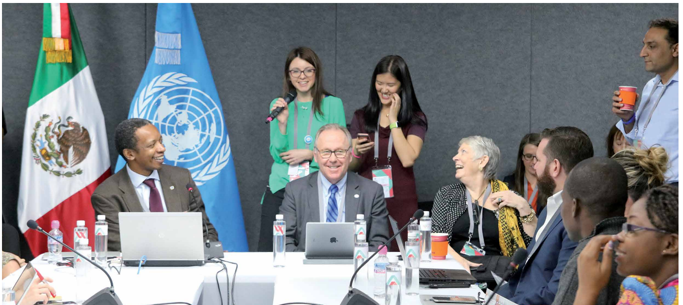
Speakers and participants share a light moment during the IGF Newcomers Track: IG Mentors Session, on Monday, 5th December. The IGF Newcomers Track is a new feature in this year's programme; read more on page 4 .