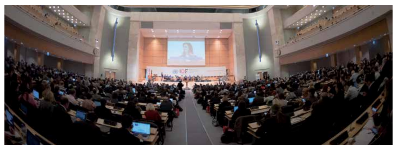
Yesterday's high-level discussion tackled the future of global digital governance.