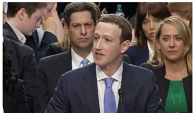
Facebook CEO Mark Zuckerberg testifying in front of US Congress on his company's practices and business model, 10 April 2018.

Countries expressed interest in exploring several specific areas, including market access commitments, trade facilitation, consumer protection, and data flows. According to ICTSD, the coalition will reconvene in May and in June, followed by a stocktaking exercise in July.